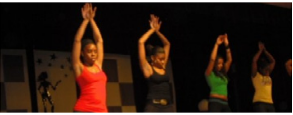
Perfomers of the MGCI Culture Show 2009.