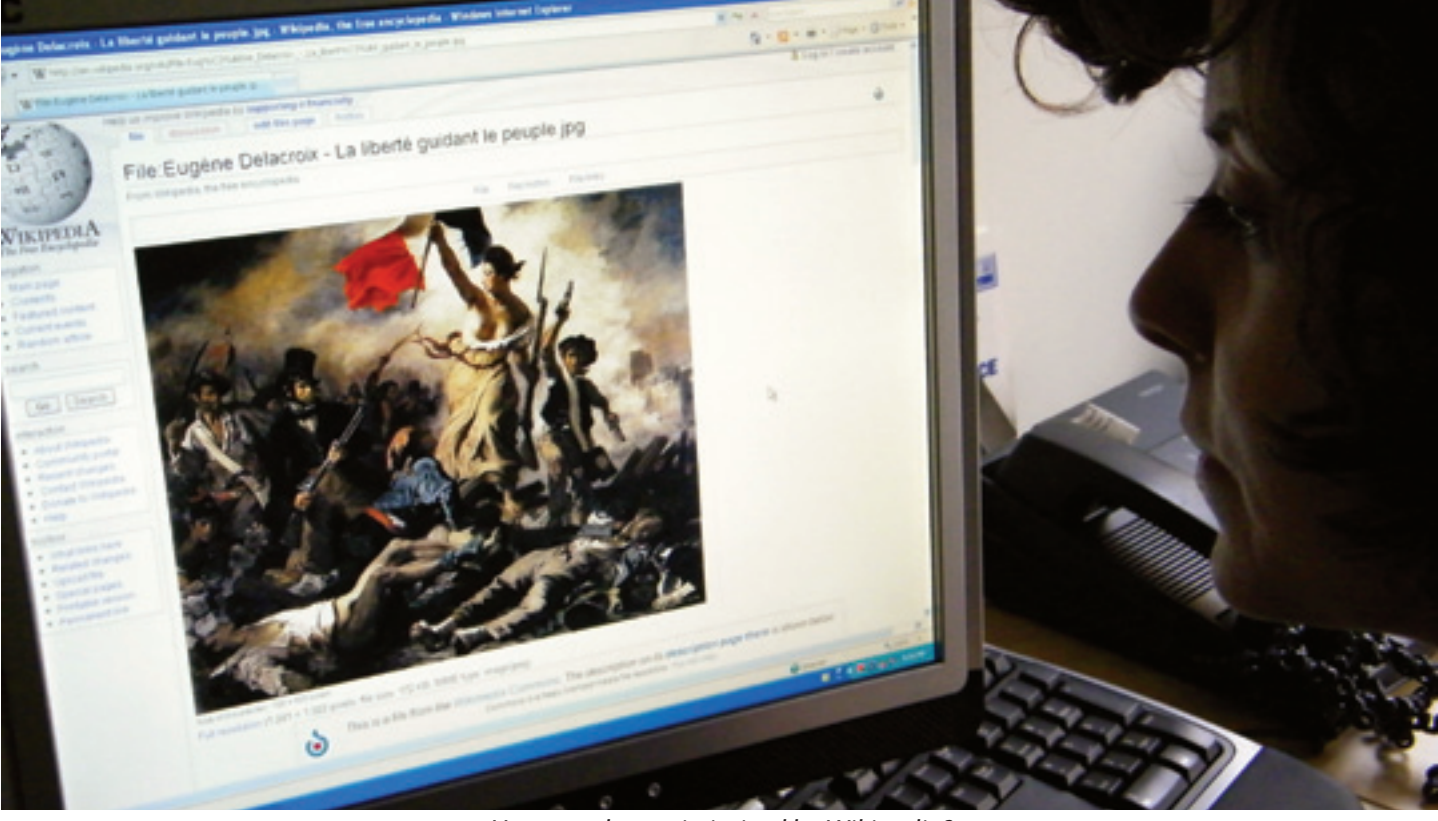
Have you been victimized by Wikipedia?

For all the last-minute research projects and the quick skim over various topics, instantly we find ourselves logged on to the well-known encyclopedia...Wikipedia! This free online encyclopedia is heaven for those looking for profound information. Wikipedia does, however, allow anyone to edit and contribute articles, which are undeniably growing numbers. Regardless, Wikipedia has successfully won the hearts of many students. Though many people emphasize the reliability of the site, Wikipedia believes in sharing information by regular people to increase knowledge. As students we find ourselves procrastinating, and therefore we must trust online sources with a blindfold. However, it is important to evaluate an article in terms of the writers and editors.